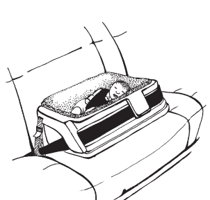
3) Car bed for babies with medical needs

2) Convertible car seat facing the rear for babies up to 30 to 45 pounds