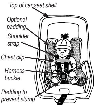
C. Parts of a car seat, showing padding along baby's head and sides and at the crotch.

Tuck rolled blankets or towels along baby's sides (C). Padding may help a new baby sit comfortably. If baby tends to slide downward, add a